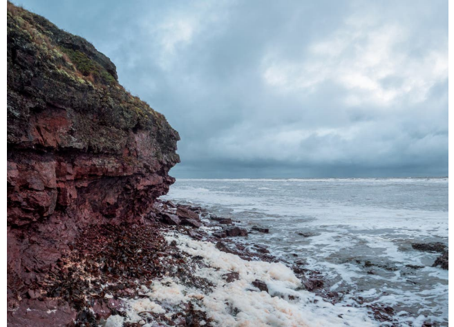
Coastal erosion on the coast of the White Sea, northwest Russia