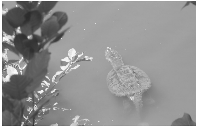
One of our Lake turtles